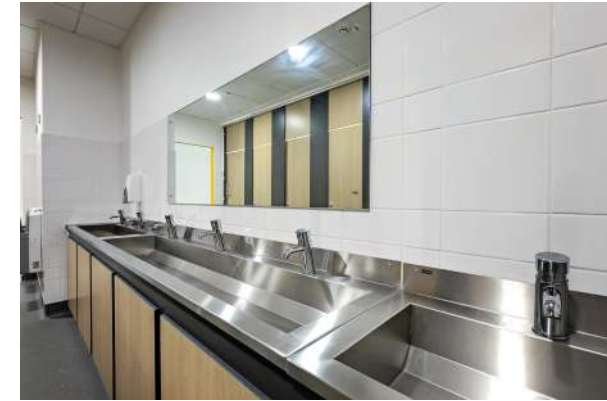
Standard End Profile:

Height: low height options available Colour: Graftix range of patterns/designs to access panels available as an extra. Unit construction options: 18mm MFC carcass with shelves and hinged doors Ply subframe with sloped under panels for access Ply sub-frame with panels supplied pre-hung on sprung cabinet hinges with key operated cam lock.